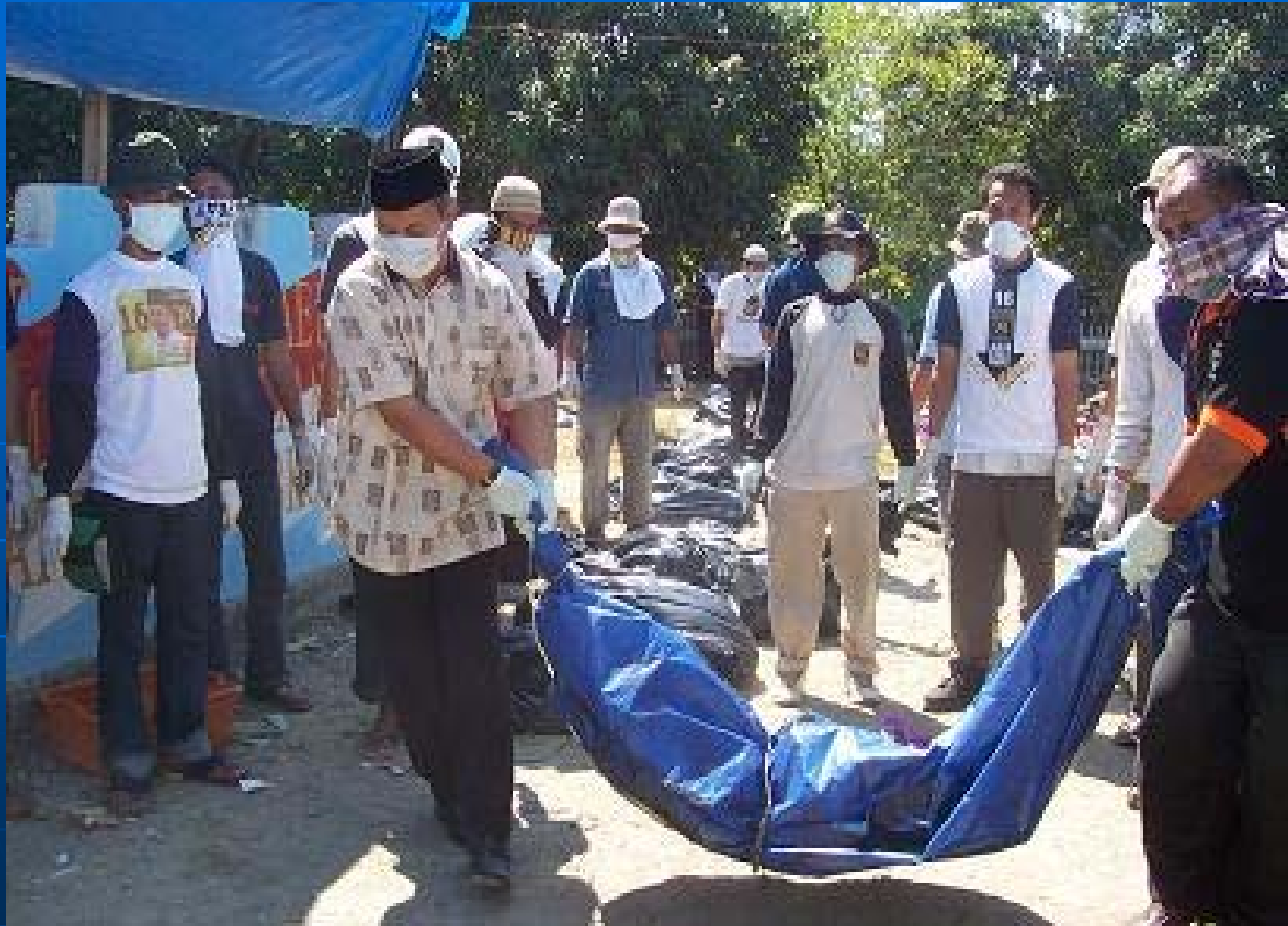
Chairman of Indonesia People's Congress helping with burial of dead victims.