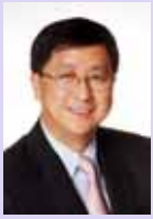
Lim Boon Heng is Minister in the Prime Minister's Office of

Singapore and concurrently Chair of the Social Enterprise Development Council of the Singapore National Trades Union Congress (SNTUC) which oversees co-operatives within the Singapore trade union movement including NTUC Fairprice and NTUC Income. He is also Minister in charge of elderly issues and a long standing Member of Parliament.